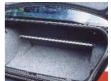
AC Schnitzer aluminium strut brace, rear axle (right)