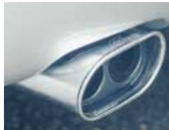
AC Schnitzer sports silencer of V2A stainless steel with chromed tailpipe