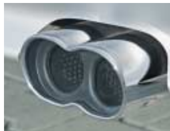
AC Schnitzer chromed tailpipe in new racing design