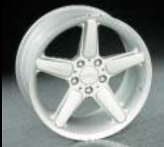
AC Schnitzer racing alloys Type II, silver with polished outer rim, in sizes 8.0J x 17", 9.0J x 17", 8.5J x 18" and 9.0J x 18"