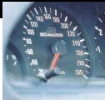
AC Schnitzer carbon fibre interior trim in black and silver with matching AC Schnitzer 3-spoke sports airbag steering wheel, available in leather, carbon fibre or root wood (large photp).