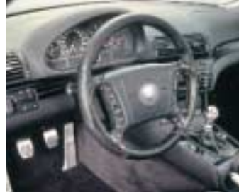
AC Schnitzer 3-spoke Smart Airbag steering wheel in leather, carbon-fibre silver or carbon-fibre black (right).