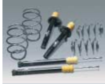
AC Schnitzer racing suspension, height-adjustable in sports firm setting (left)