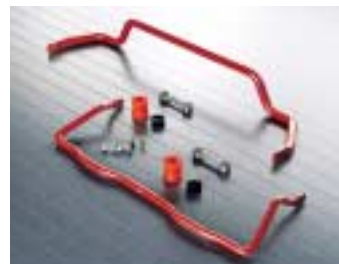
AC Schnitzer special antiroll bar kit for front and rear axle, 2 settings for front axle (left)