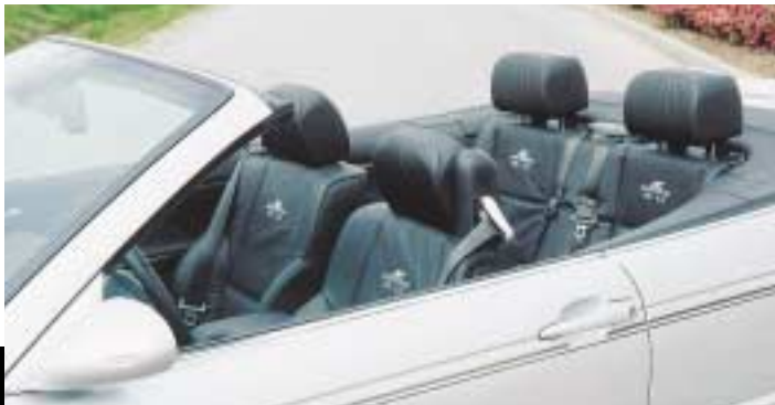
Interior trim with exclusive leather and embroidered AC Schnitzer logos for all seats