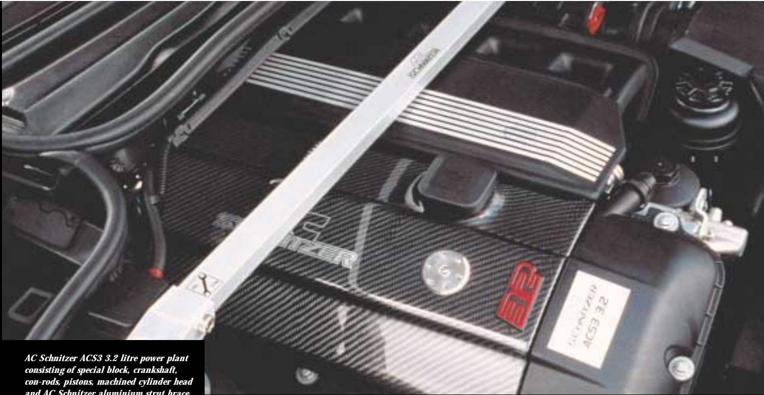
AC Schnitzer ACS3 3.2 litre power plant consisting of special block, crankshaft, con-rods, pistons, machined cylinder head and AC Schnitzer aluminium strut brace on the front for greater vehicle stability