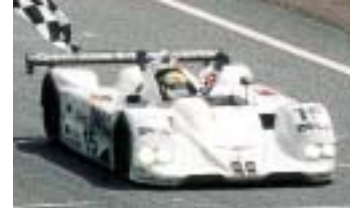
1999 Victory in the Le Mans 24h race in the BMW V12 LMR