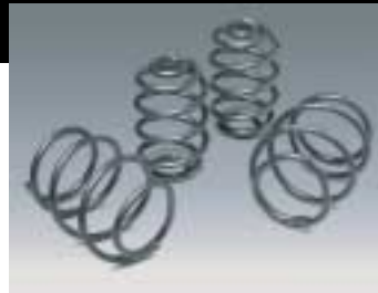
AC Schnitzer spring kit lowering up to 30 mm