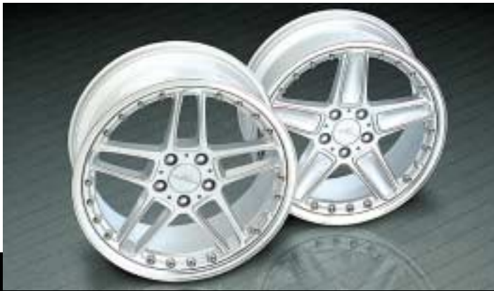
AC Schnitzer racing alloys Type III, multi-piece, silver with polished outer rim, in sizes 8.5J x 18", 8.5J x 19", 9.0J x 19". Optional design elements can be painted individually; AC Schnitzer alloys Type III, silver, in sizes 8.5J x 17", 8.5J x 18" and 8.5J x 19". Optional design elements can be painted individually