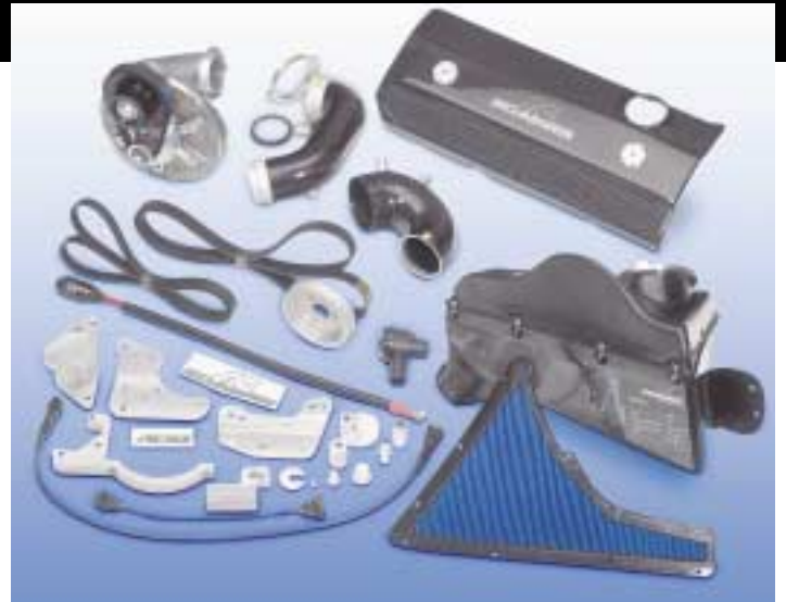
AC Schnitzer ACS3 COMPRESSOR kit gives an extra 47 kW (64 HP) with a boost pressure of 0.35 bar (top)