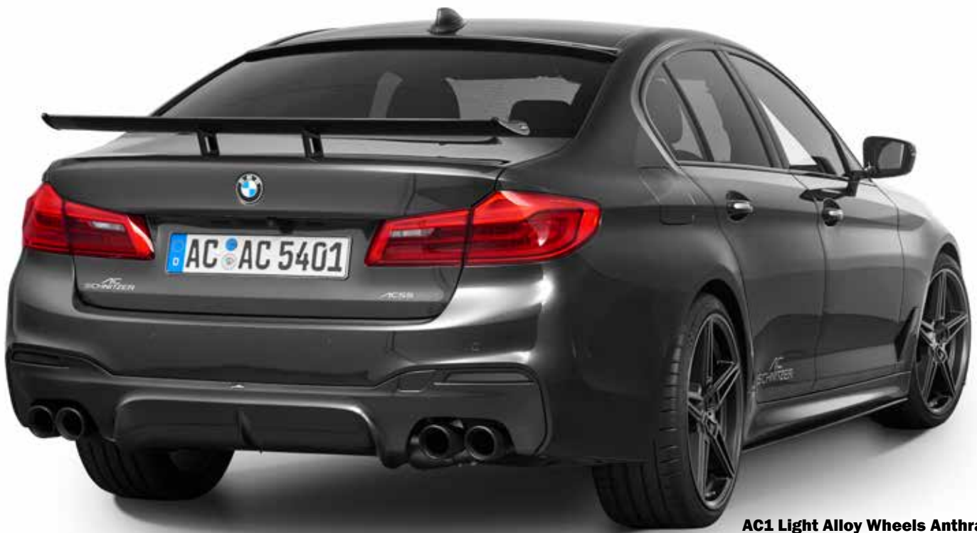
AC1 Light Alloy Wheels Anthracite