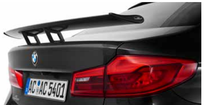
Carbon "Racing" rear wing