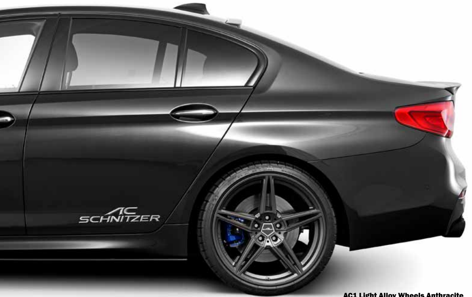
AC1 Light Alloy Wheels Anthracite