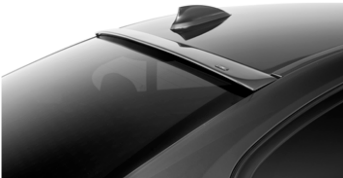
Rear roof spoiler