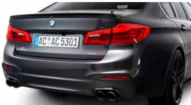
Rear spoiler, rear skirt protection foil