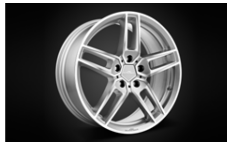
Type VIII Light Alloy Wheels BiColor Silver, Anthracite (not shown) or BiColor Black in 19 and 20 inch