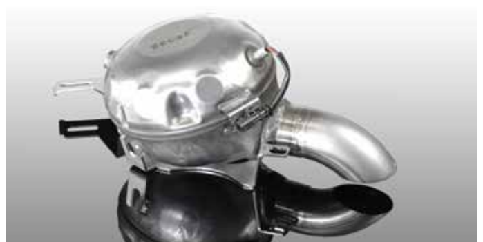
Sound module incl. remote control