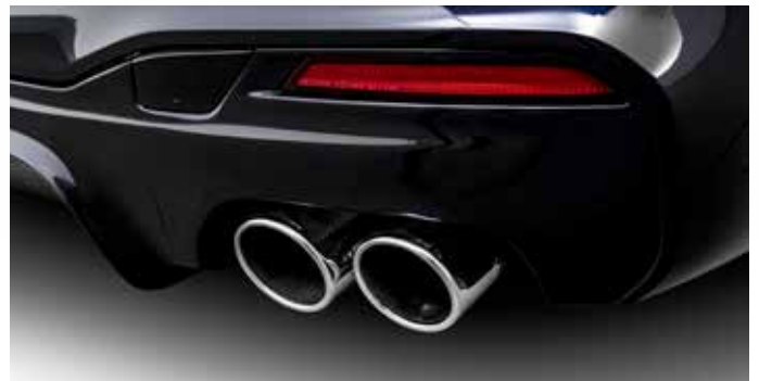
"Quad Sport" tailtrims chromed (Black not shown) in right/left combination