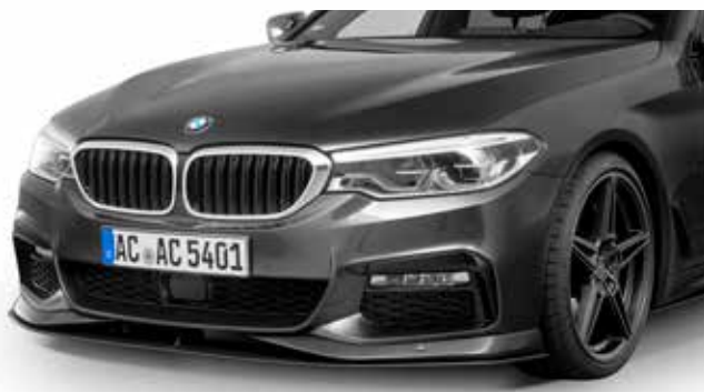
Carbon front spoiler elements, front splitter, AC1 Light Alloy Wheels Anthracite