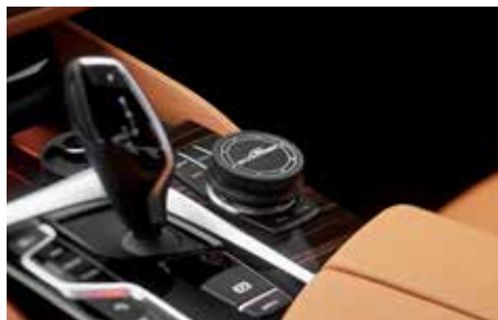
Aluminium cover "Black Line" for iDrive controller