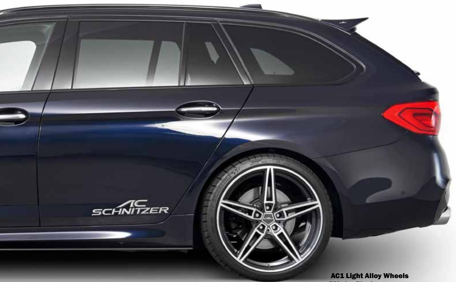
AC1 Light Alloy Wheels BiColor Black