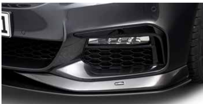
Carbon front spoiler elements, front splitter