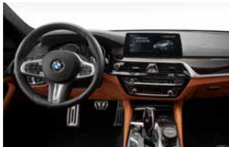
Aluminium pedals, foot rest, aluminium cover "Black Line" for iDrive controller, velours floor mats, key holder