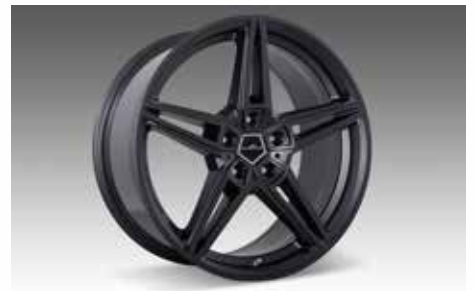
AC1 Light Alloy Wheels BiColor Black or Anthracite in 19 and 20 inch