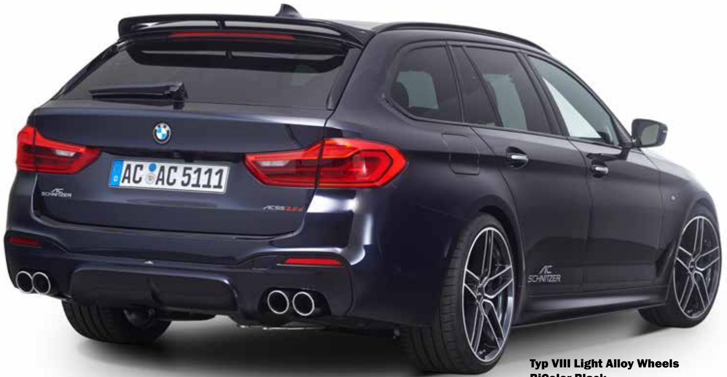
Type VIII Light Alloy Wheels BiColor Black