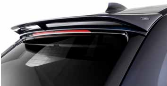
Rear roof wing