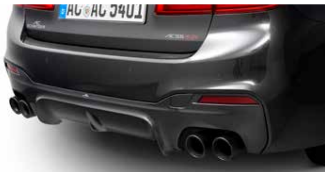
Rear diffuser with silencer and 2 "Sport Black" tailtrims each side in right/left combination