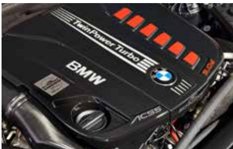
Performance upgrades for 520d, 530d, 530i, 540i, M550i - incl. warranty