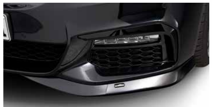
Front spoiler elements