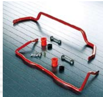
AC Schnitzer special antiroll bar kit.