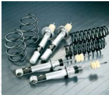
AC Schnitzer sports suspension and spring kit.