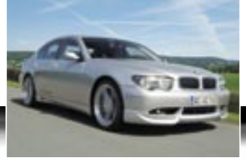
The AC Schnitzer suspension kit is perfectly set up for the saloon.