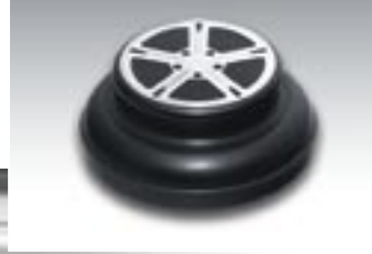
The AC Schnitzer Aluminium Cover in the style of the Type IV wheel.