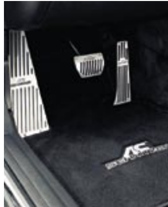
Fine, fine: The AC Schnitzer aluminium cover for the BMW i-Drive system, the aluminium pedal set and the velours mats with logo – all contribute the final touches to the refined ambience.