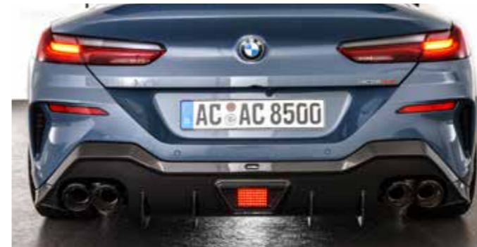
Carbon rear diffuser with optional brake light, silencer with carbon "Sport" tail pipes