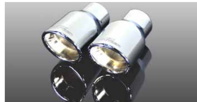
"Sport" tail pipes, chromed, "Sport black" not shown