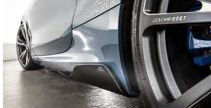
Carbon side skirts