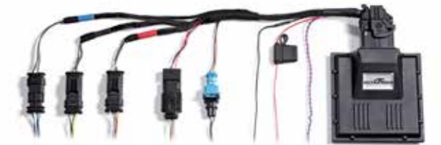
Performance upgrades incl. warranty for 840d with 235 kW/320 HP to 279 kW/380 HP M 850i with 390 kW/530 HP to 456 kW/620 HP