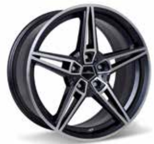
AC1 Light Alloy Wheel 20 inch BiColor