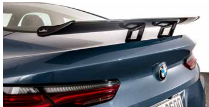
Carbon "Racing" rear wing