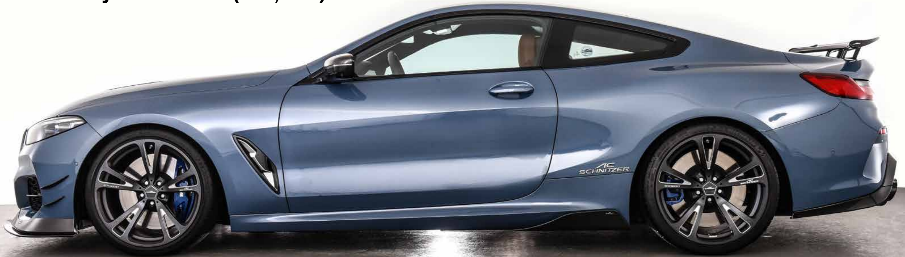
AC3 Lightweight Forged wheels BiColor anthracite/silver