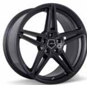
AC1 Light Alloy Wheel 20 inch anthracite