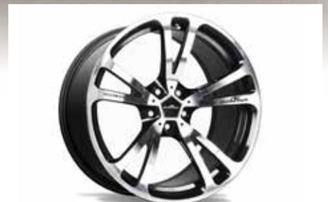
AC3 Lightweight Forged wheel 20 inch BiColor silver/anthracite