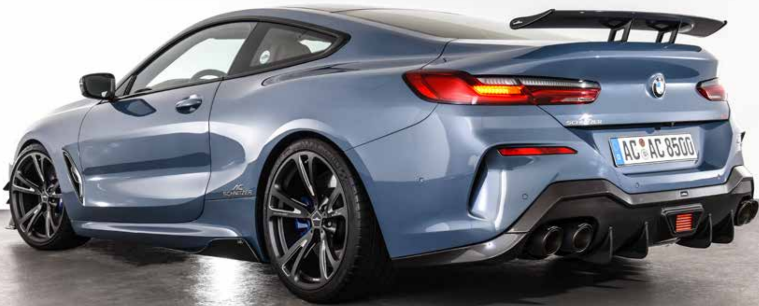
AC3 Lightweight Forged wheels BiColor anthracite/silver