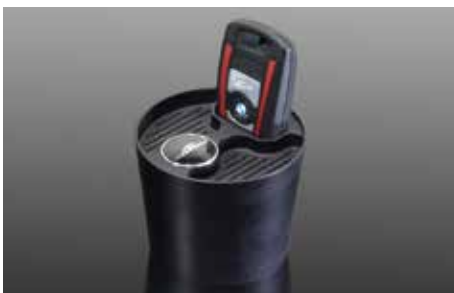
Aluminium key holder