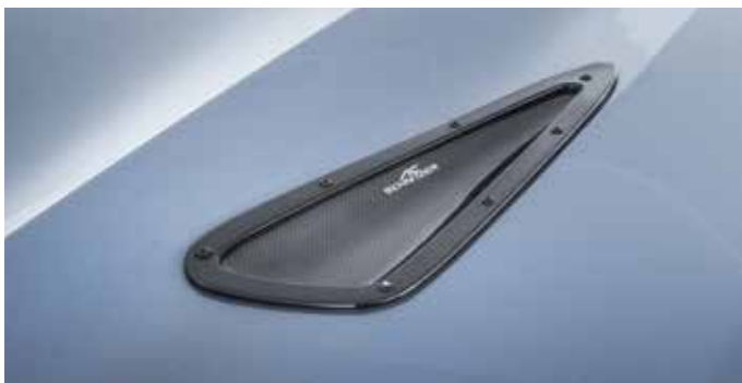
Bonnet vents with carbon inserts