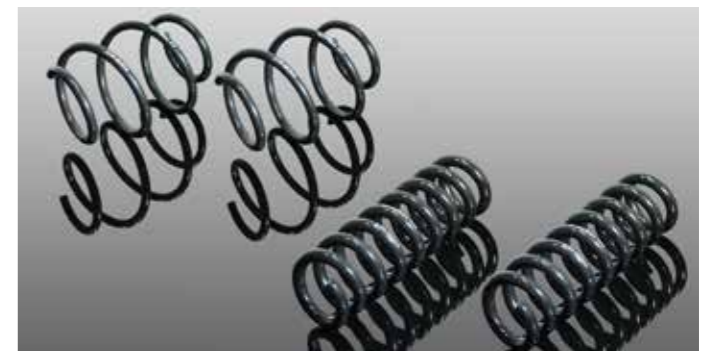
Spring kit, lowering: front and rear approx. 20 mm