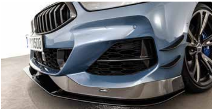
Carbon front spoiler elements, front splitter, carbon front side wings, AC3 Lightweight Forged wheels BiColor anthracite/silver