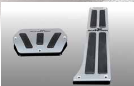
Aluminium pedal set, 2-piece