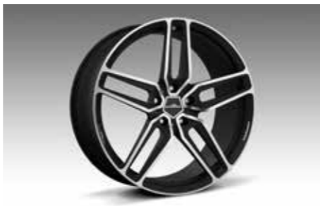
Type VIII Lightweight Forged Wheel BiColor 21 inch