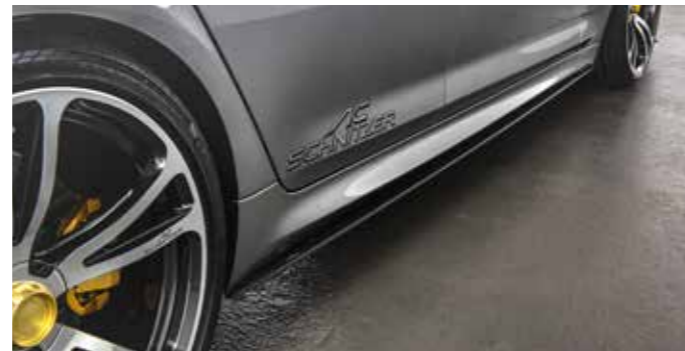
Side skirts, AC3 "Evo" Lightweight Forged Wheels BiColor silver/anthracite with central lock in gold