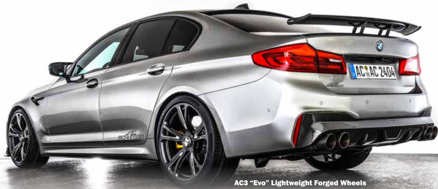
AC3 "Evo" Lightweight Forged Wheels BiColor anthracite/silver with central lock in grey Carbon "Racing" rear wing