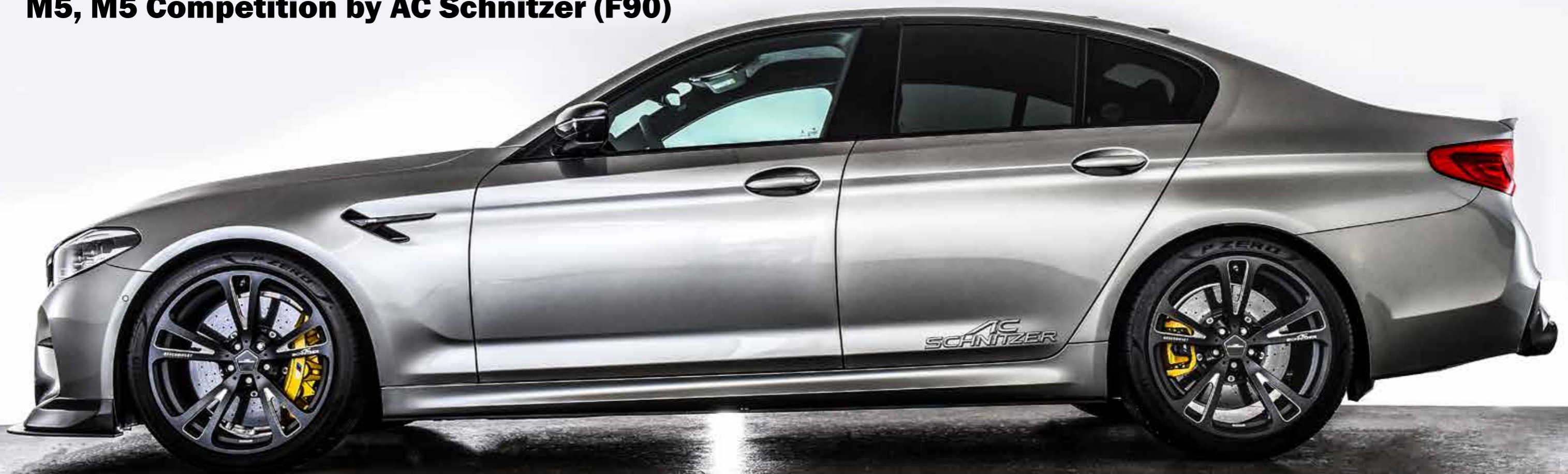
AC3 Lightweight Forged Wheels BiColor anthracite/silver