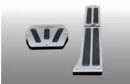
Aluminium pedals, 2-piece