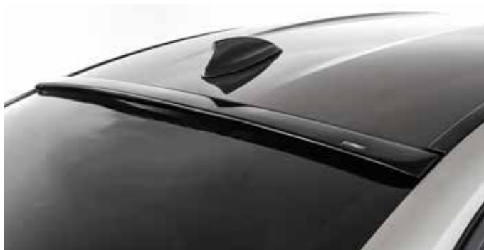
Rear roof spoiler