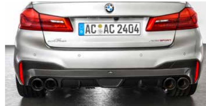
Rear skirt protection foil, carbon rear diffuser, silencer with "Carbon Sport" tailpipes