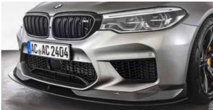
Carbon front spoiler elements, front splitter, AC3 Lightweight Forged Wheels BiColor anthracite/silver