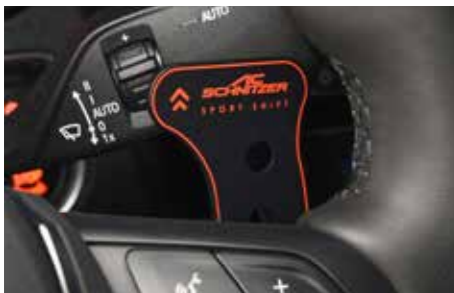
Shifting paddles, set