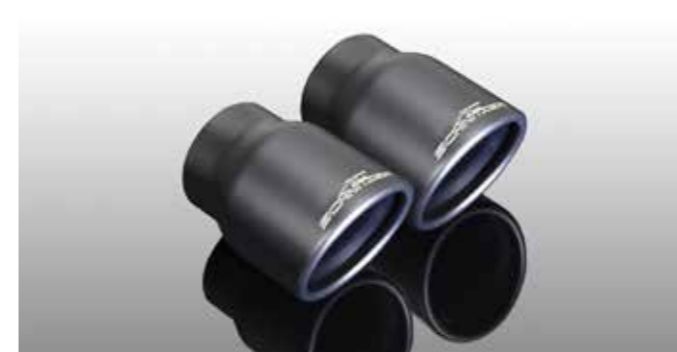
"Sport black" tailpipes "Sport" tailpipes, chromed (not shown)