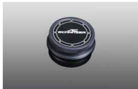
Aluminium cover for the BMW iDrive system controller