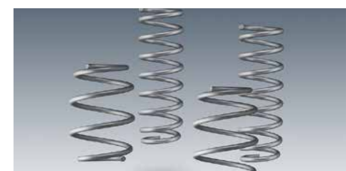
Spring kit, lowering front approx.: 20 - 25 mm rear approx.: 10 - 15 mm