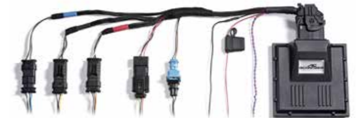
Performance upgrade incl. warranty for M5 (without OPF) to 515 kW/700 HP/850 Nm M5 Competition in preparation