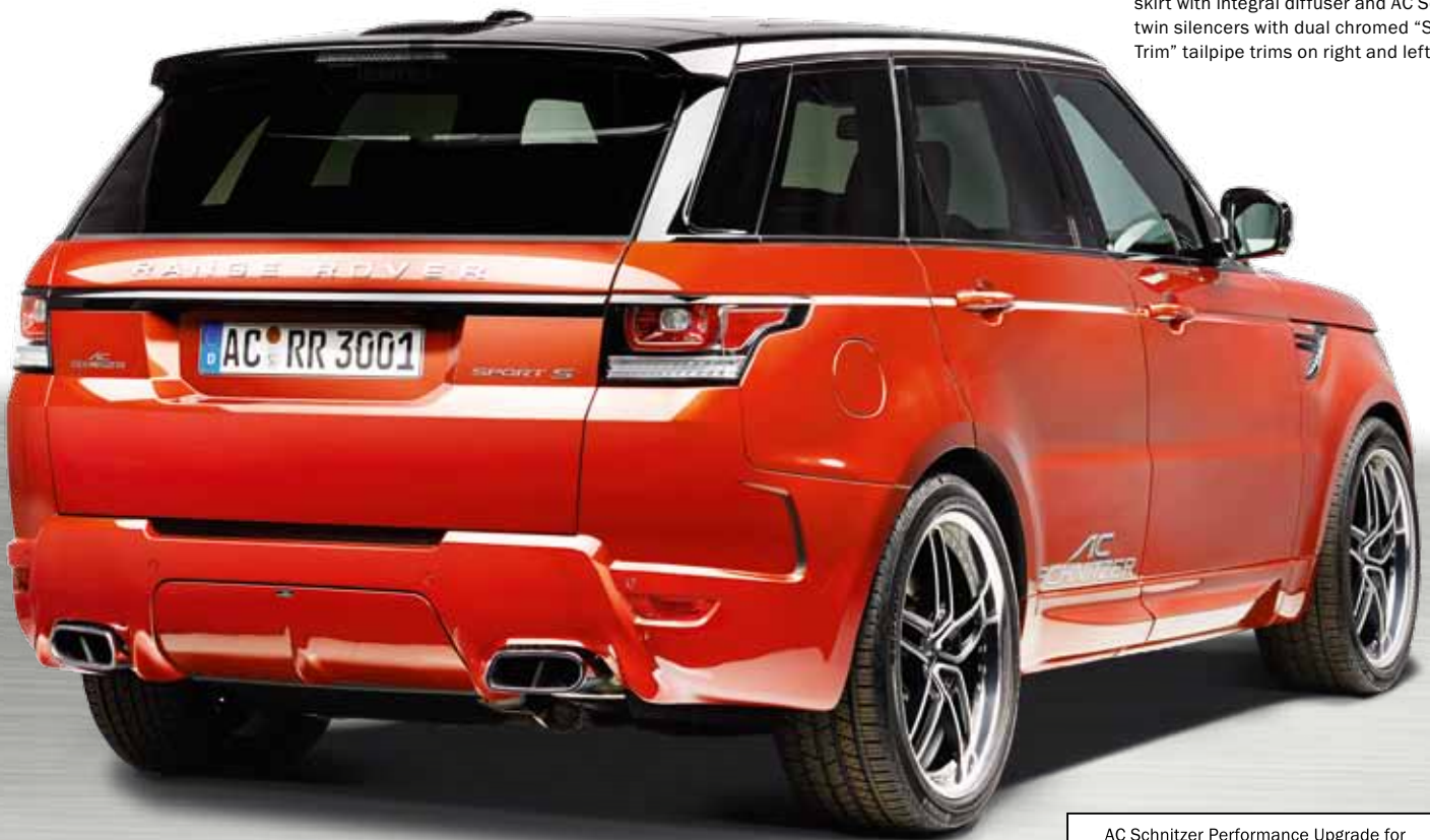
Masculine elegance: AC Schnitzer rear skirt with integral diffuser and AC Schnitzer twin silencers with dual chromed "Sports Trim" tailpipe trims on right and left.

The AC Schnitzer keyholder and the subtly branded floor mats of fine velours continue the dynamic cinema experience in 3D into the exclusive interior. Cue – camera – action!