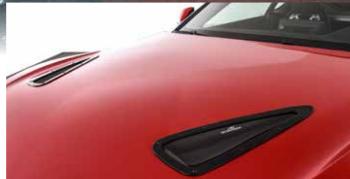
Bonnet vents (in Germany: use only for racing purposes)