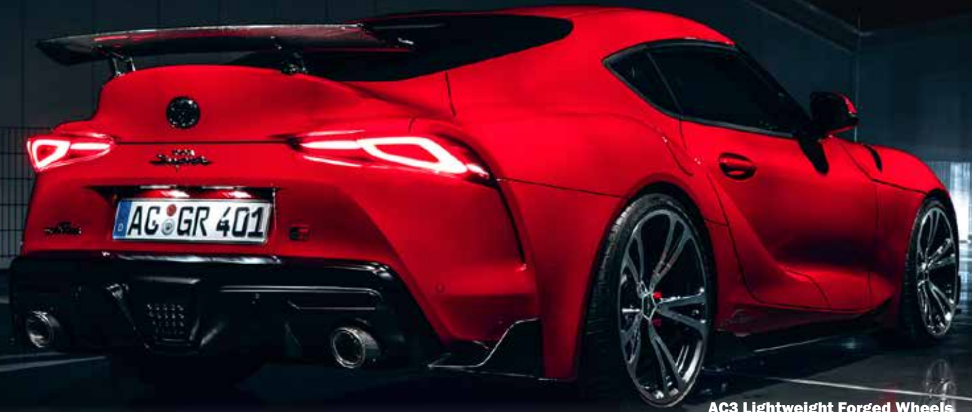
AC3 Lightweight Forged Wheels BiColor Silver/Anthracite 20 inch