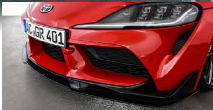
Front splitter, license plate holder