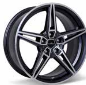
AC1 Light Alloy Wheel BiColor 20 inch