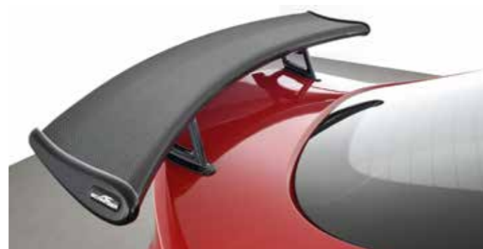
Carbon "Racing" rear wing Optional Gurney Flap (not shown)