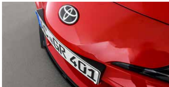
License plate holder, front