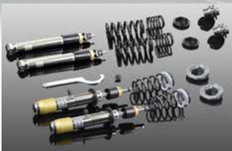
Height adjustable RS suspension adjustable bump and rebound lowering approx. 25 mm