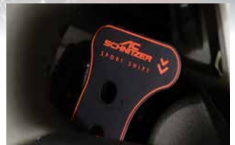
Aluminium gear shift paddles, set