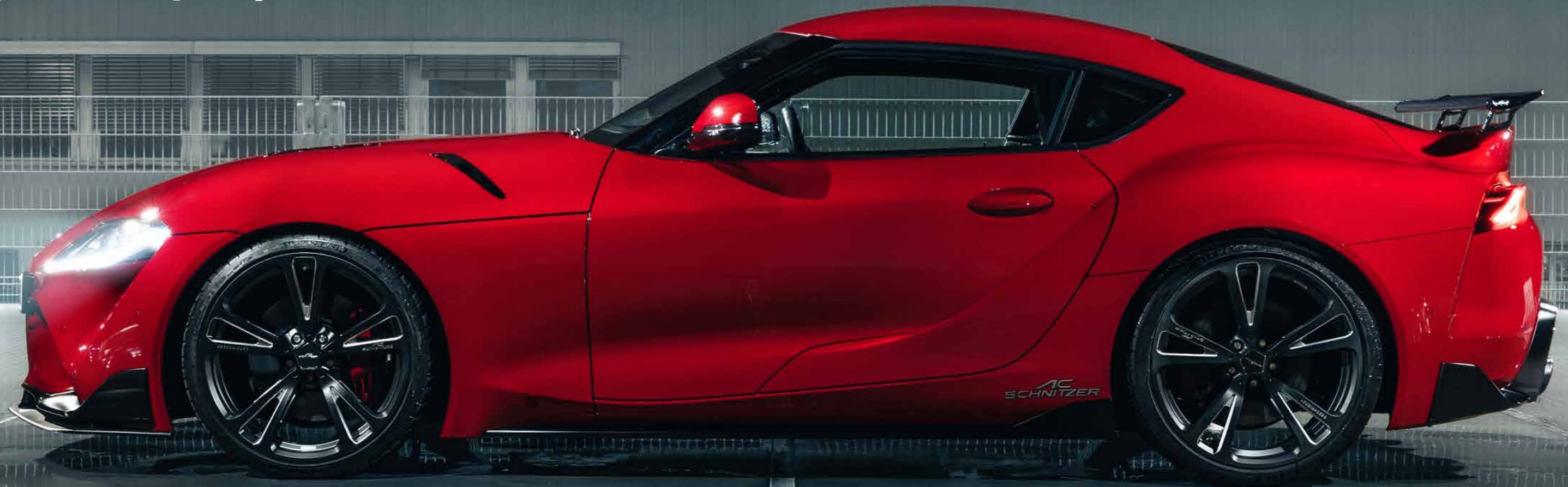
AC3 Lightweight Forged Wheels BiColor Anthracite/Silver 20 inch