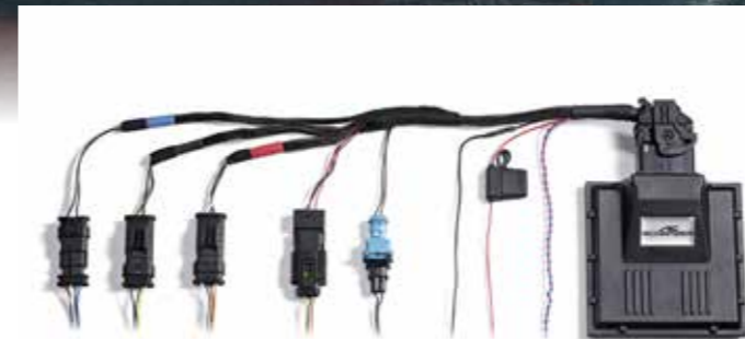
Performance upgrade incl. warranty for 3.0l with 250 kW / 340 HP / 500 Nm to 294 kW / 400 HP / 600 Nm