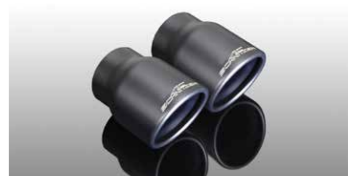
Tailpipes "Sport" black (only in connection with sports rear silencer)