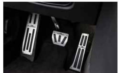
Aluminium pedals, set and foot rest