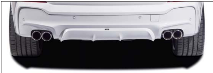
Rear diffuser (M-Technik), silencer with 2 "Sport" tailtrims