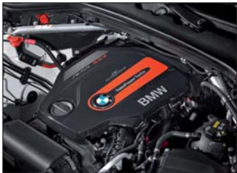
Performance upgrades, engine optics