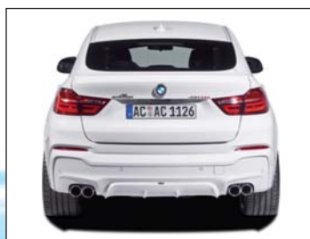
Rear skirt protection foil, rear diffuser (M-Technik), silencer with 2 "Sport" tailtrims