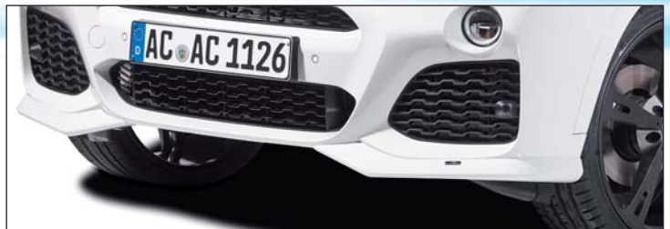
Front spoiler elements (M-Technik)