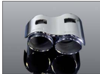
Tailtrim "Racing Evo"