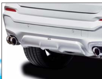
Rear skirt protection foil, rear diffuser (M-Technik)