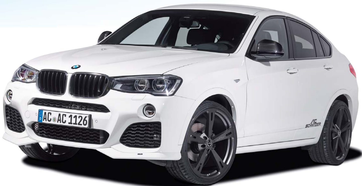
Type V Lightweight Forged Wheels Anthracite