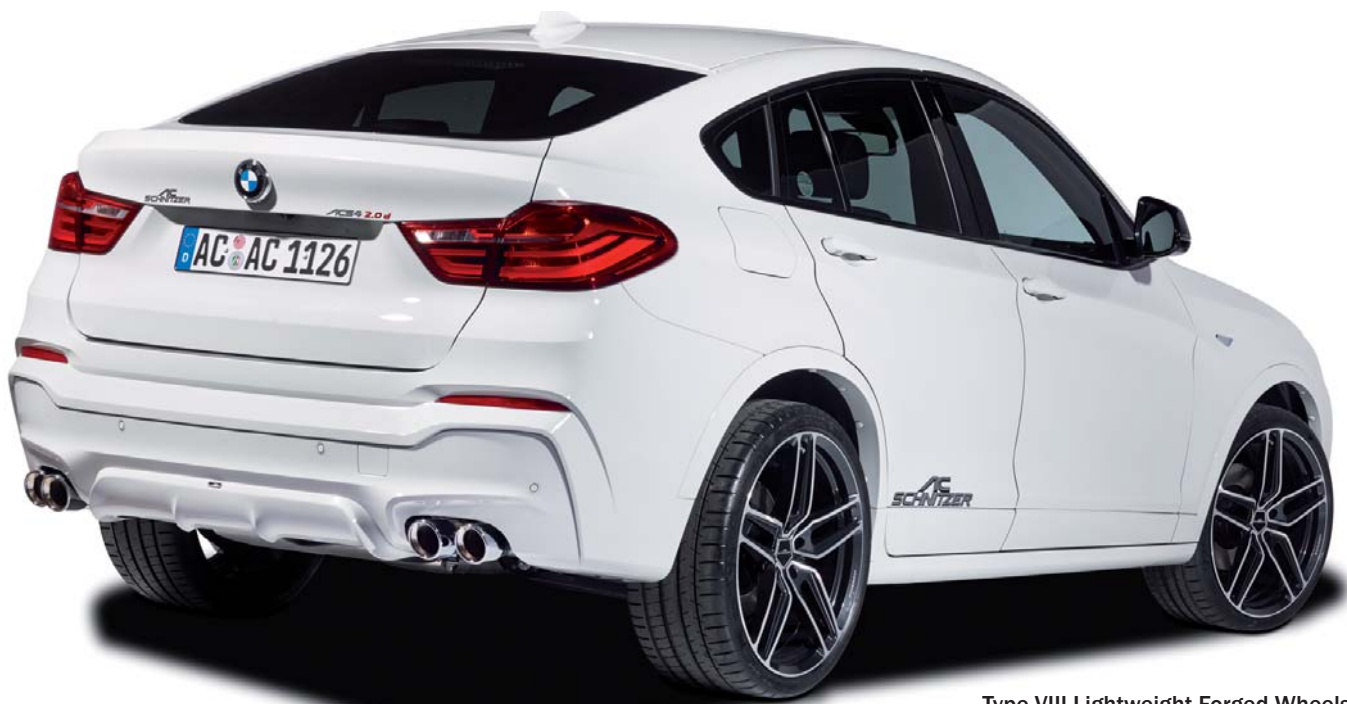
Type VIII Lightweight Forged Wheels BiColor