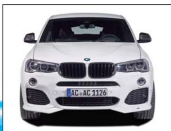
Front spoiler elements (M-Technik)