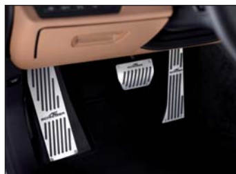
Aluminium pedal set, foot rest, velours floor mats