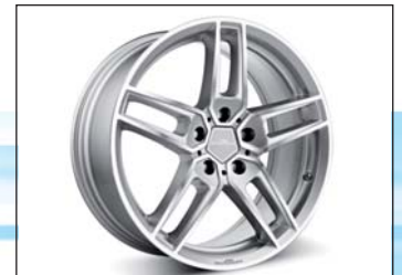
Type VIII Wheels BiColor Silver