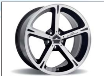
Type IV Wheels BiColor Black or Silver