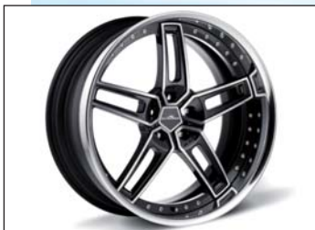
Type VIII Racing Forged Wheels BiColor