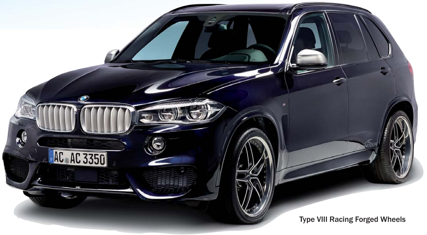
Type VIII Racing Forged Wheels