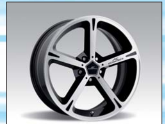
Type IV Wheel BiColor

The tuning experts at AC Schnitzer have taken the X5 into their workshop to give the third generation SUV a facelift. The result is a vehicle which can scarcely be equalled in terms of power, sporting performance and superiority.