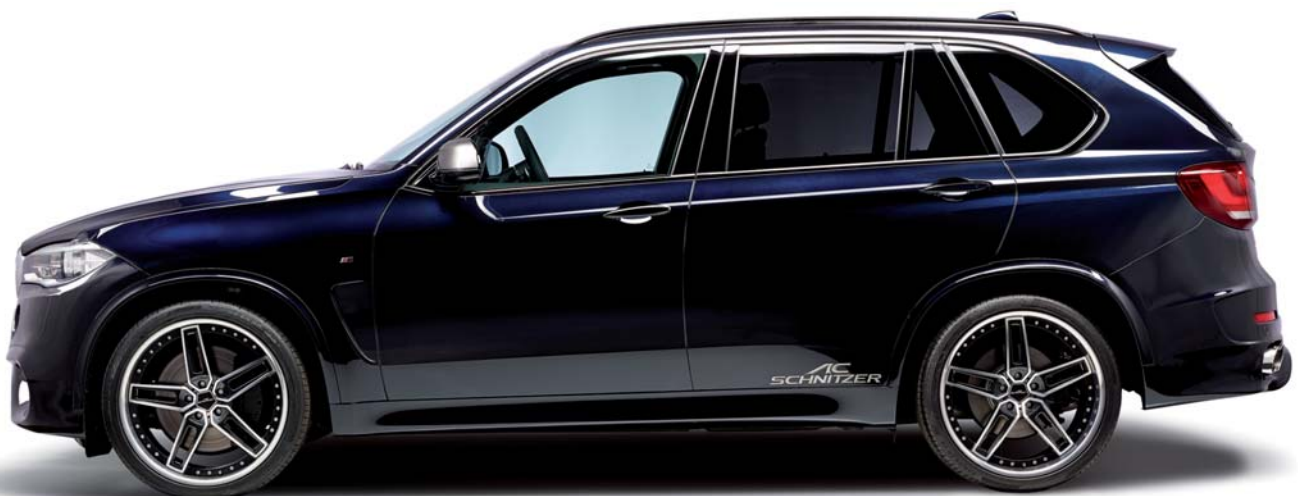
Front skirt, rear skirt with integrated rear diffuser, silencer with two "Racing" tailtrims, Type VIII Racing Forged Wheels