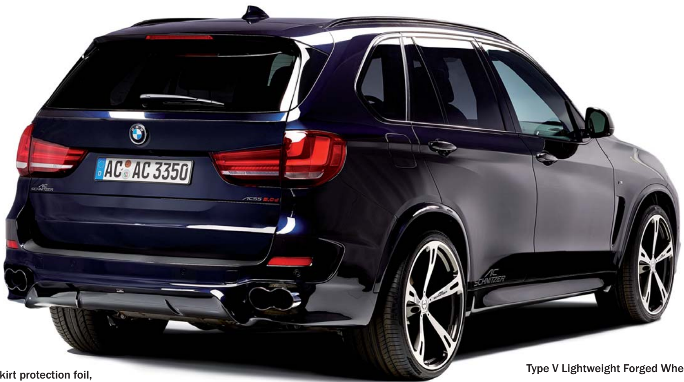
Rear skirt protection foil, rear skirt with integrated rear diffuser, silencer with two "Racing" tailtrims, right/left combination