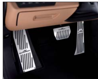
Aluminium pedals, foot rest, velours floor mats