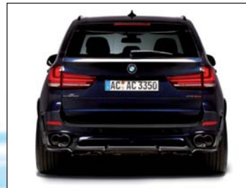
Rear skirt with integrated rear diffuser, silencer with two "Racing" tailtrims