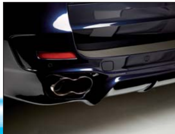
Silencer with two "Racing" tailtrims