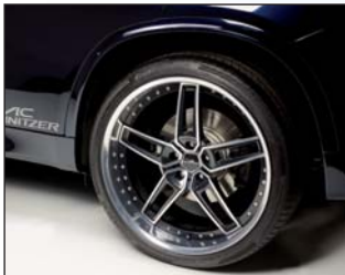
Type VIII Racing Forged Wheel

The tuning experts at AC Schnitzer have taken the X5 into their workshop to give the third generation SUV a facelift. The result is a vehicle which can scarcely be equalled in terms of power, sporting performance and superiority.