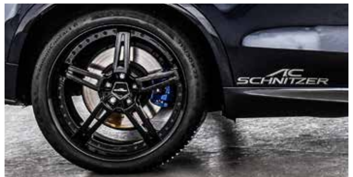
Emblem 250 mm, AC1 Racing Forged Wheel Black in 22 inch