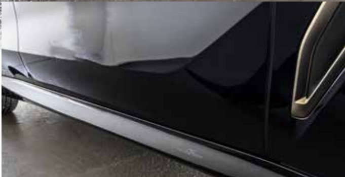
Side skirts protection foil