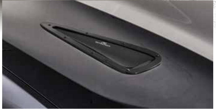
Bonnet vents (in Germany applies: use only for racing purposes)