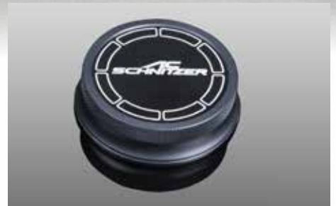
Aluminium cover "Black Line" for iDrive controller