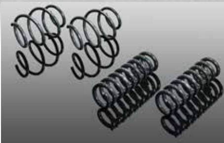
Spring kit, lowering Front: approx.: 20 – 25 mm Rear: approx.: 20 – 25 mm