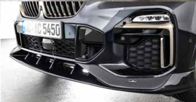
Front spoiler for X5 with M-Aerodynamics package