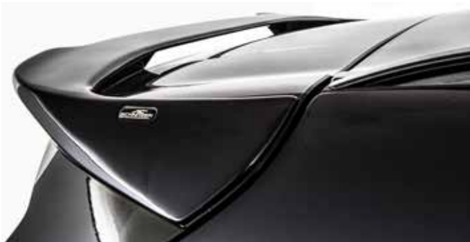
Rear roof wing