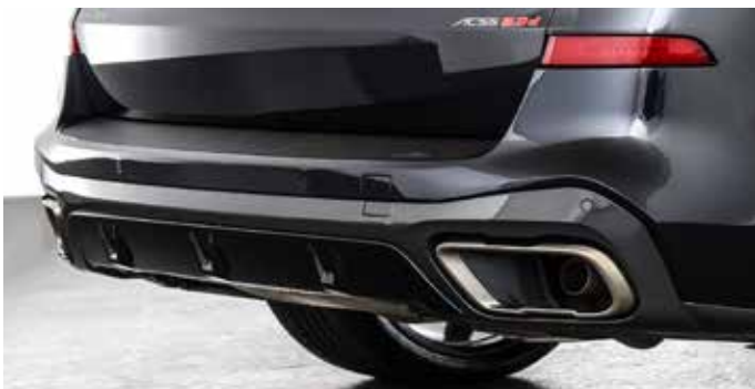
Rear skirt protection foil