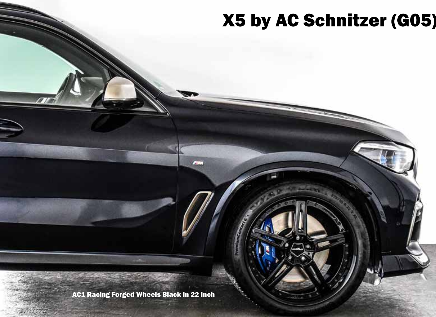
AC1 Racing Forged Wheels Black in 22 inch