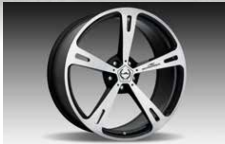
Type V Lightweight Forged Wheels BiColor in 22" Type VIII Racing Forged Wheels (not shown) in 22"