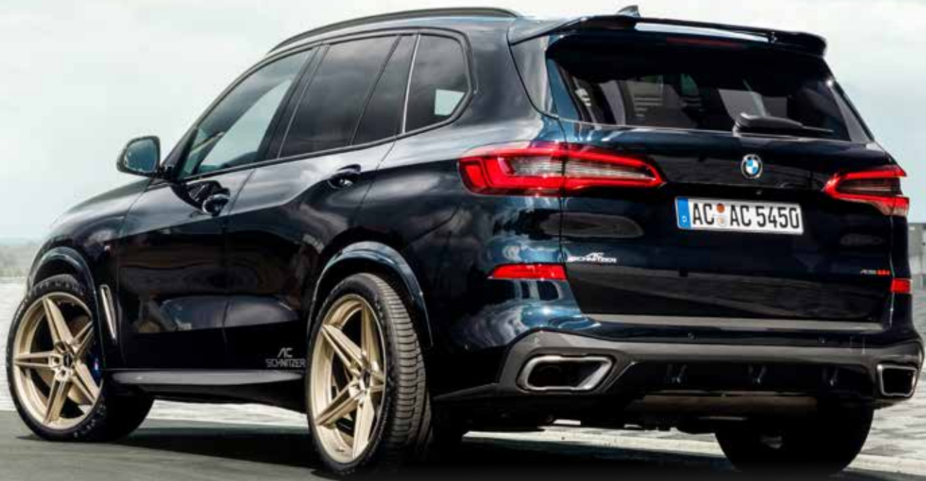
AC1 Light Alloy Wheels in 22 inch with individual painting