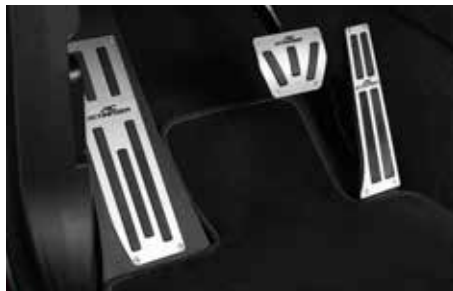
Aluminium pedal set (2-piece) and foot rest