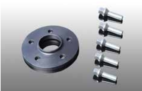
Wheel spacers 12 mm each side for standard rims