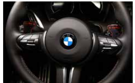
Shifting paddles, set