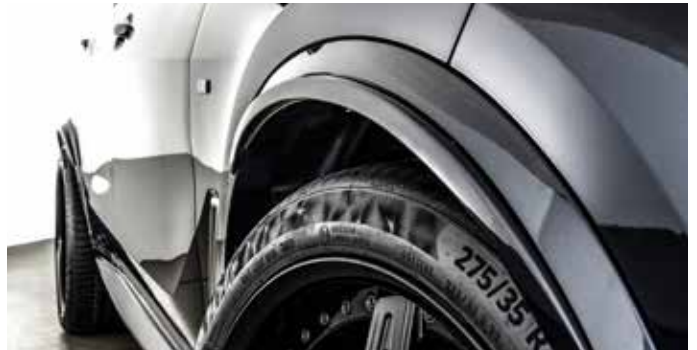
Wheel arch extension front: each approx. 14 mm and rear: each approx. 26 mm