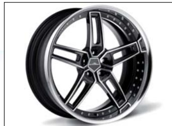
Type VIII Racing Forged Wheels BiColor