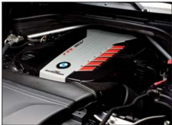
Performance upgrades, Engine optics