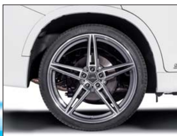
AC1 Light Alloy Wheels BiColor or Anthracite