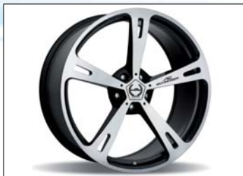
Type V Lightweight Forged Wheels BiColor or Anthracite