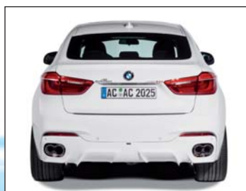
Rear diffuser, twin silencer with 2 "Racing" tailtrims