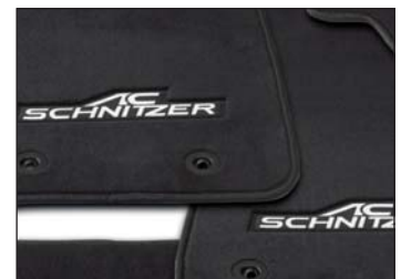
Velours floor mats