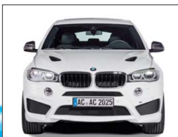
Carbon mirror covers, bonnet vents, front skirt