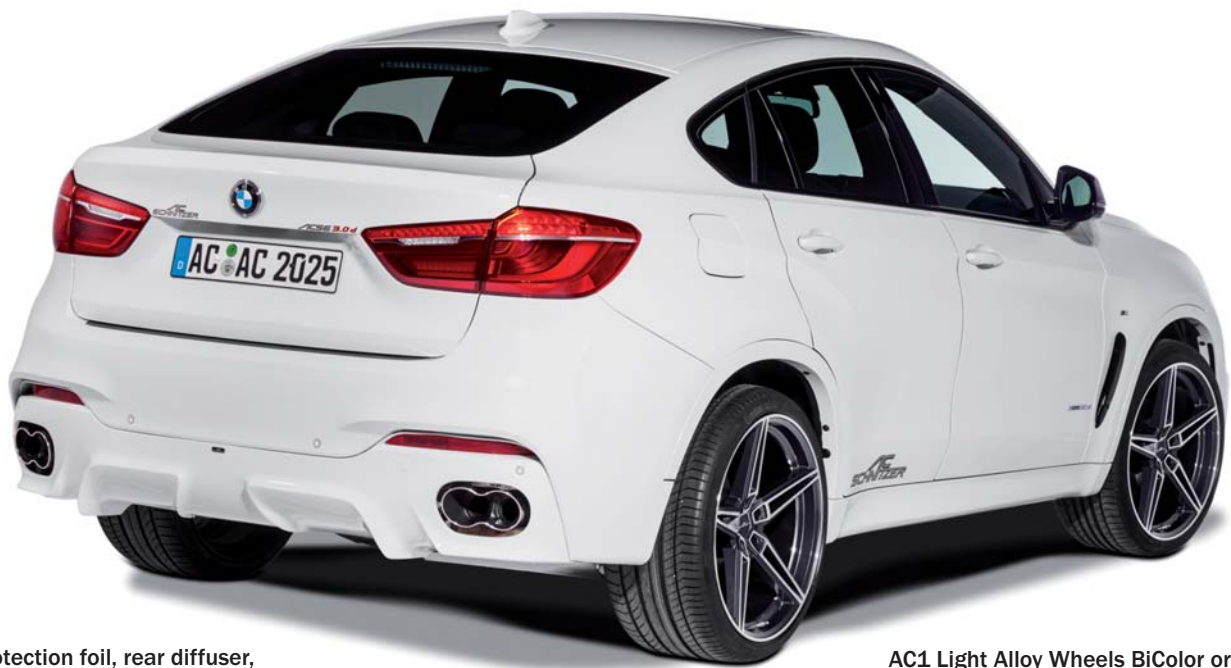
Rear skirt protection foil, rear diffuser, twin silencer with 2 "Racing" tailtrims