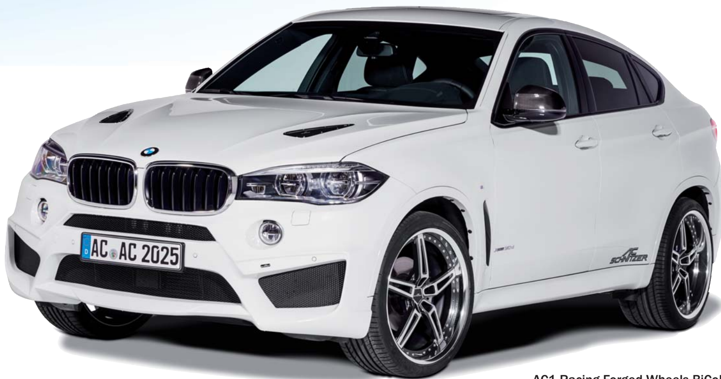
AC1 Racing Forged Wheels BiColor