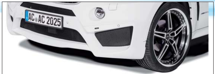
Front skirt, AC1 Racing Forged Wheels