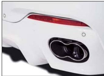
Silencer or twin silencer with 2 "Racing" tailtrims