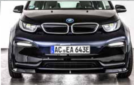
Front splitter with adaptors