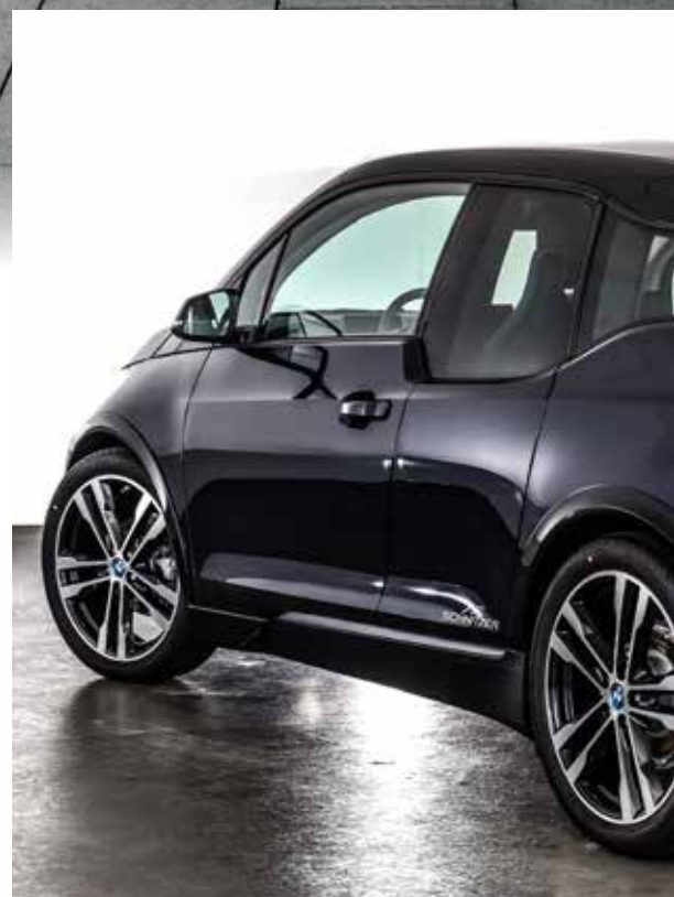
Spacers 12 mm each side, rear roof wing, rear skirt protection foil, emblems