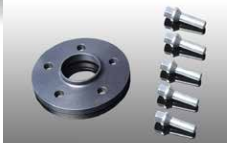
Spacers 12 mm each side