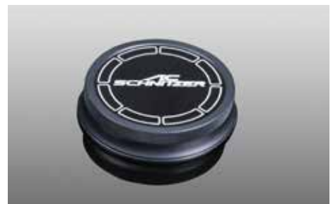
Aluminium cover "Black Line" for iDrive controller