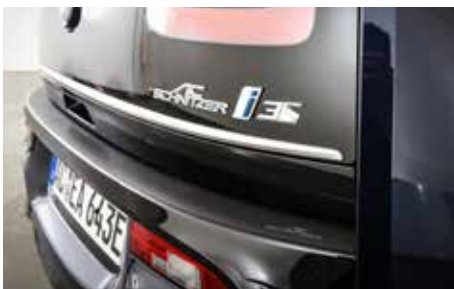
Rear skirt protection foil