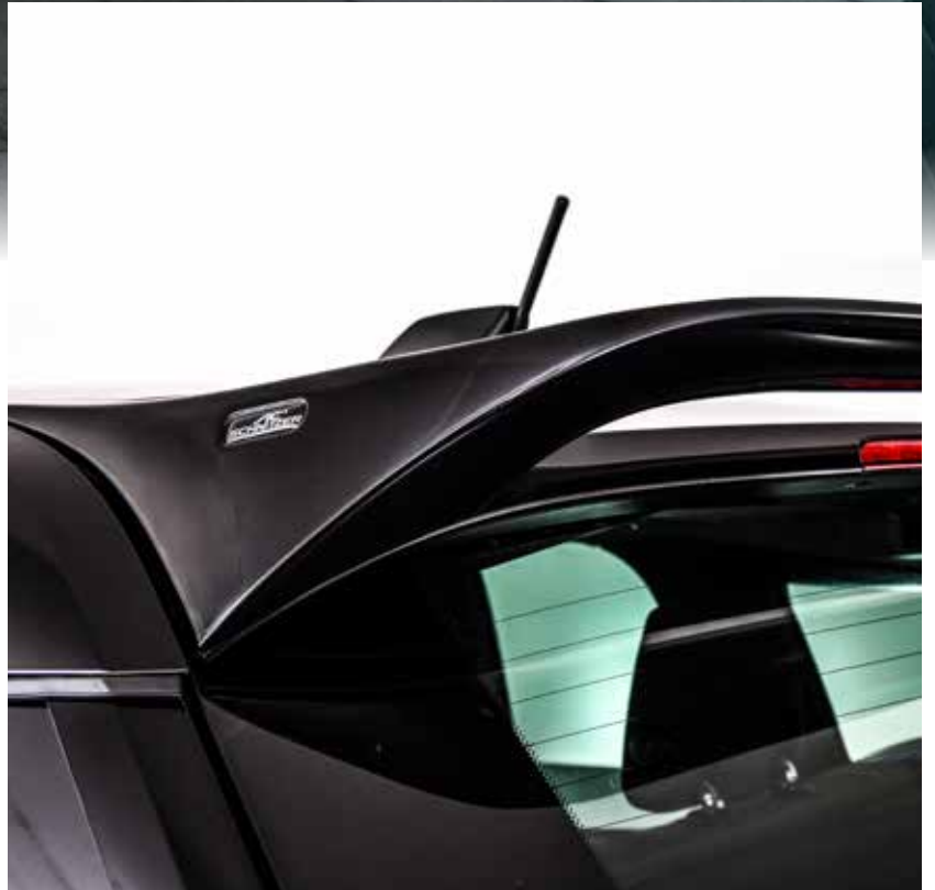
Rear roof wing painted shiny black