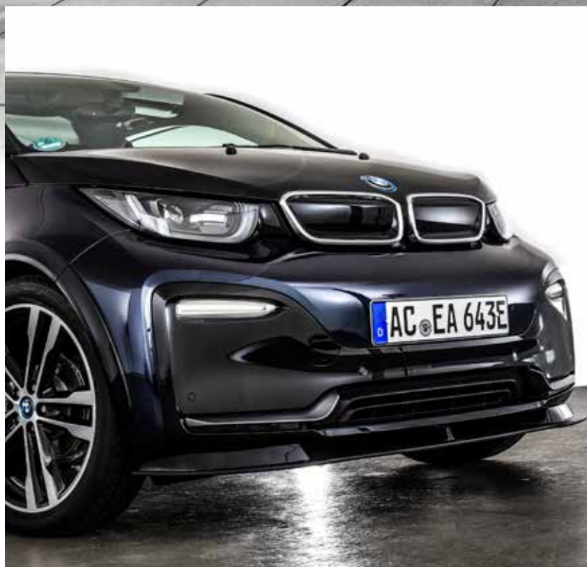
Front splitter with a matt black surface and black glossy adaptors